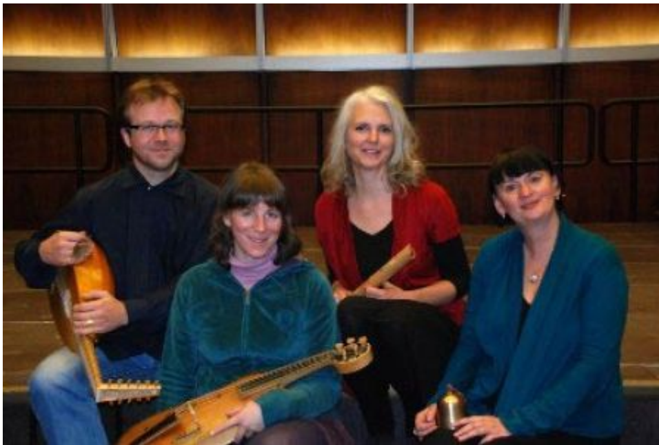
Das Ensemble Palatino 87

The songs of the Codex are one to three voices. Incredibly complex contrapuntal masterpieces are next to catchy songs, sometimes lyrical, sometimes powerful. With their poetic texts, the ballate, cacce and madrigale give a colorful picture of culture in the courtly and upper middle-class circles of the Italian Trecento. With varied instrumentations and the moderation by the musicians, the unusual repertoire is presented very lively.